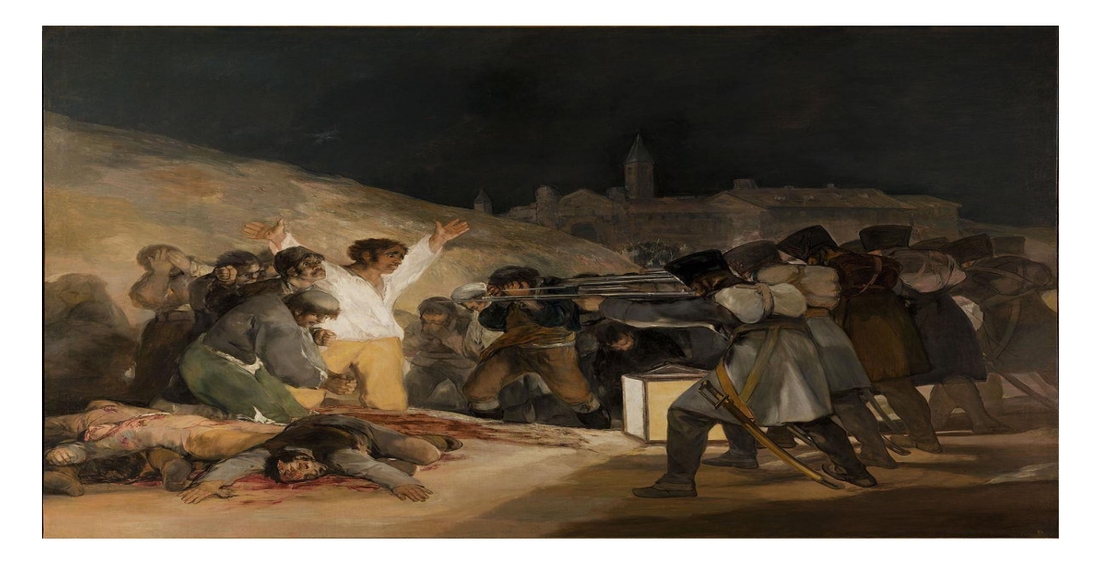
The Third of May 1808 by Francisco de Goya (1914)